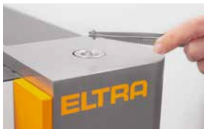
Introducing the sample

All ELTRA analyzers are characterized by their simple operation and quick C/S or O/N/H measurement of powders, granules, wires or foils. After weighing the sample and logging it into the software, all further steps are carried out automatically and the results are provided shortly after the analysis has started.