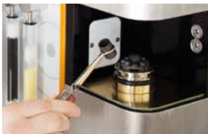
Placing the crucible